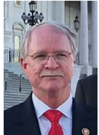
Representative Rutherford, also an original co-sponsor of the LEOSA Act Legislation (which will be featured next month in the Grapevine)

S.774 Status: Referred to the Committee on Judiciary.